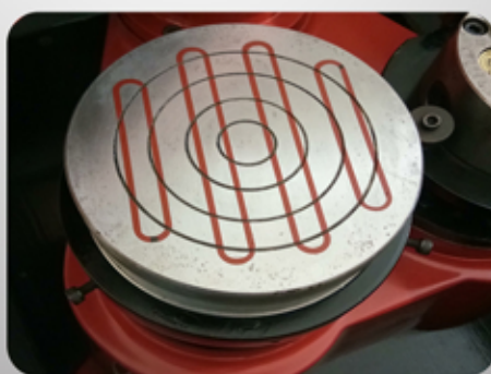
Magnetic Chuck with Swivel