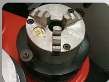
3 - Jaw Chuck