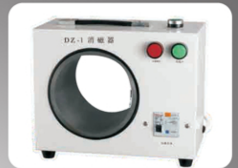
Demagnetizer ( Optional )

Specifications are subject to change without prior noticed