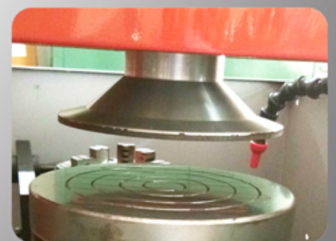
Aluminium oxide Grinding Wheel